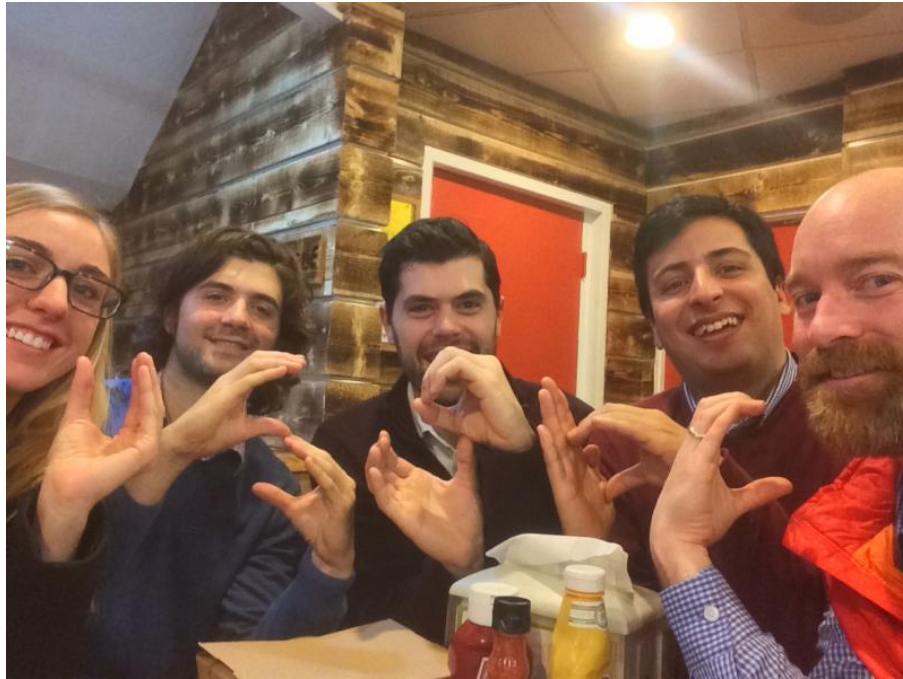
How do you spell USGBC? "T-E-A-M!" [Chapter staff at a recent lunch outing]